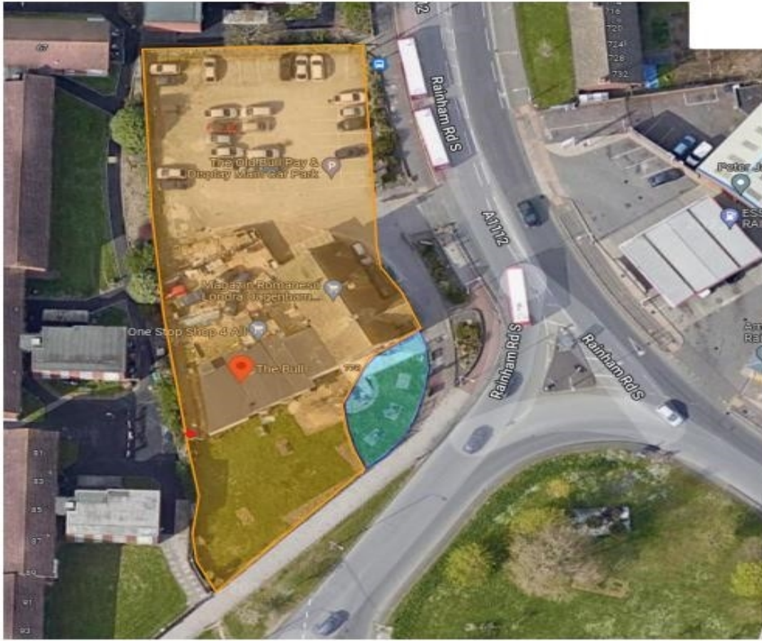
Area shaded orange - The Bull Public House owned by Hollybrook