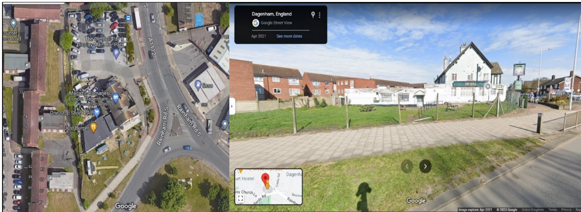
Prehoarding photographs showing pub outside seating on LBB land